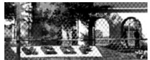
North Central Correctional Facility is ablaze with beautiful flower gardens.